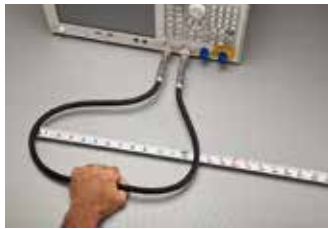
Flex Test (one full cycle)