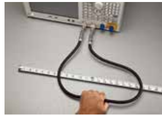
Cable is pulled off center 10" in both directions

** Phase stability data IAW Times' phase/flex test criteria as demonstrated above.